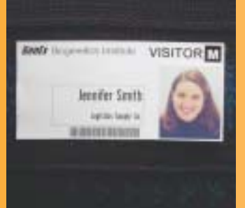
Color-Coded I.D. Badges